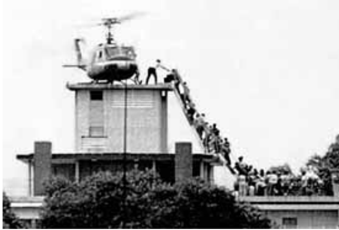
Last helicopter out of Saigon 4/30/75