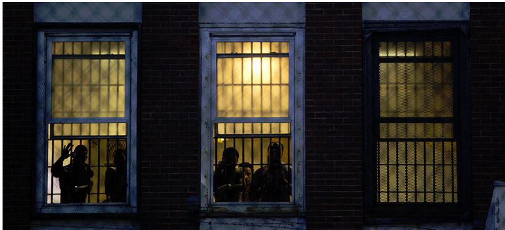
Inmates at the Workhouse jail in St Louis.

Hell On Earth: “Those Awaiting Trial In Their Airless Cells Were Enduring An Unimaginable 115 Degrees” “The Prisoners Have Not Been Convicted Of A Crime”