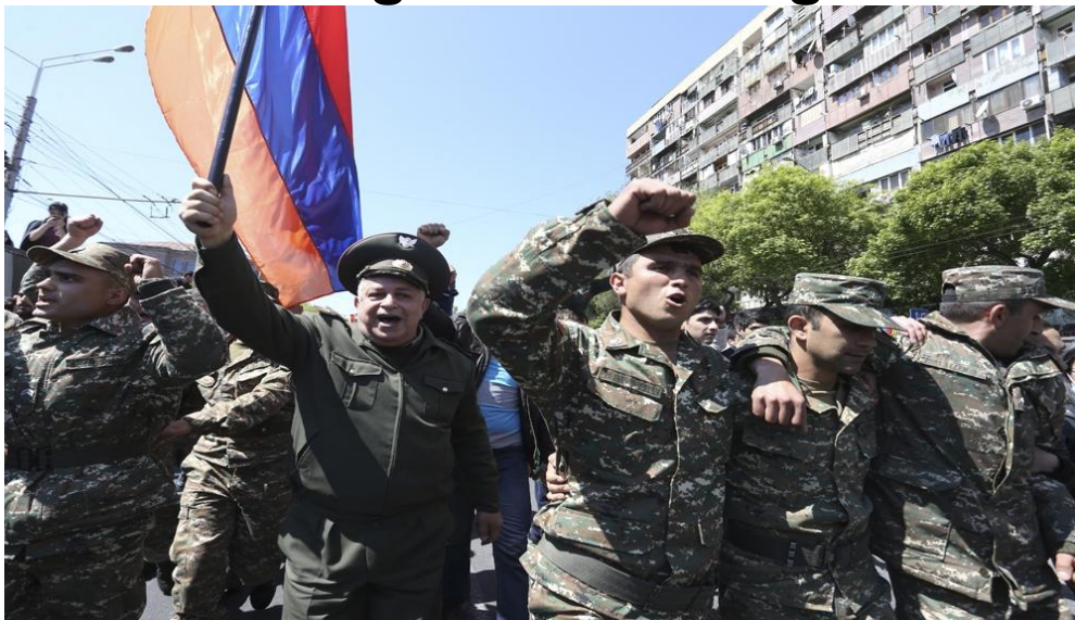
Members of the military took part in anti-government protests in Yerevan on Monday

Soldiers Join “Thousands Of Anti-Government Protesters” To Bring Down Government In Armenia: “We Saw Soldiers Take To The Streets, We Saw Priests, Children And Their Parents, Young And Old Coming Out To Show Armenia Was Really United In Wanting These Changes”