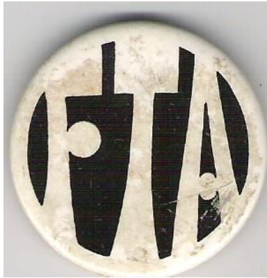
U.S. Soldiers Pin: Vietnam Days

Carl Bunin Peace History April 26 - May 2