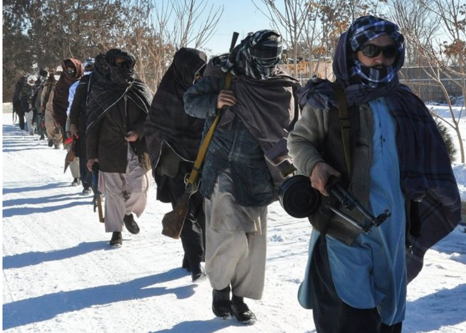
Taliban fighters in Ghazni province on January 16....