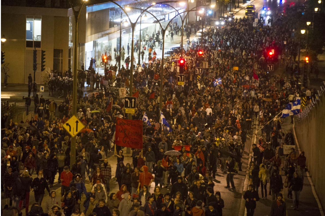
Rogério Barbosa -- AFP/Getty Images