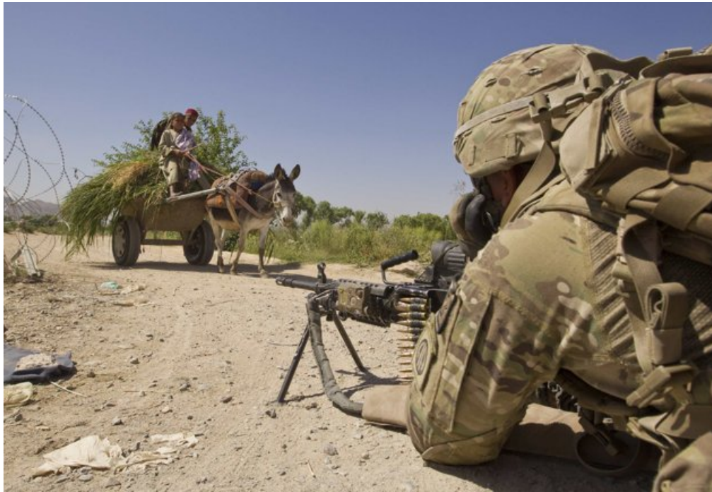
Children rides on a cart past a gunner of the Battle company, 1-508 Parachute Infantry battalion, 4th Brigade Combat Team, 82nd Airborne Division, securing a road during a patrol in Zahri district of Kandahar province, southern Afghanistan May 27, 2012.