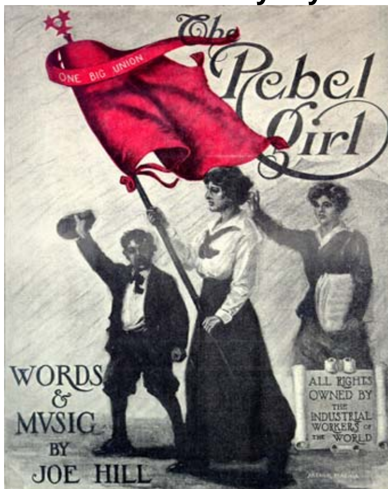
Cover illustration by Arthur Machia for The Rebel Girl . Words & Music by Joe Hill (Ithaca, NY: Glad Day Press, 1940, c1915).