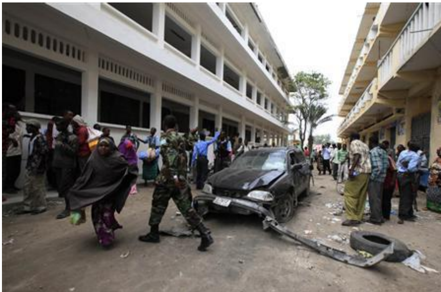
The scene of a car bomb attack in the Hamarwayne district of Somalia's capital Mogadishu, July 16, 2012.