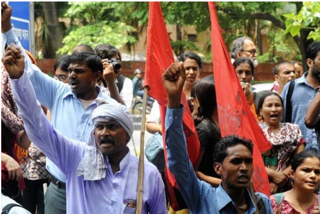
Trade union members and demonstrators shouted slogans against Maruti Suzuki in New Delhi Friday.