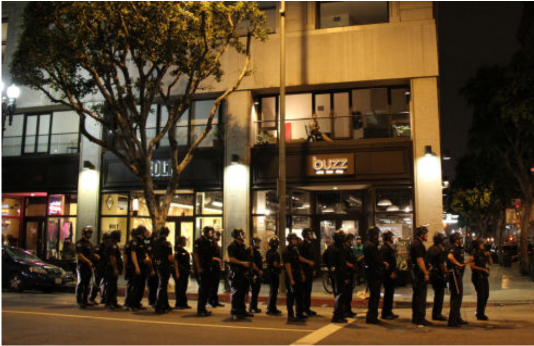
Los Angeles police prepare to attack citizens for chalking on the sidewalk or demonstrating support for people who chalk on the side walk.

In order to fight these unreasonable charges, occupiers devised an action to give out “free chalk for free speech” along with fliers detailing the recent arrests during the city’s monthly art walk event.