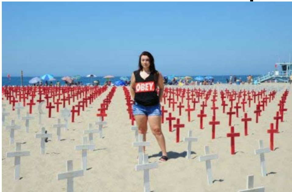
Arlington West in Santa Monica, California August 19, 2012.