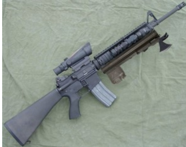
The IMBTB Mounted Under The M16A4

August 5, 2012 By armydave, The Duffle Blog.