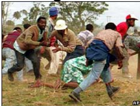
Panic spread quickly through the crowd