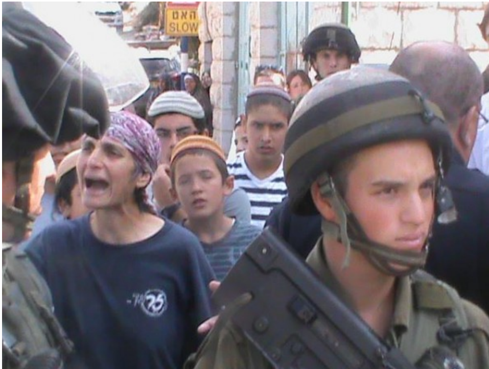
Zionist settlers in Tel Rumeida who attacked the Abu Eisheh family.

At this point all the family was forcibly removed from their land by the army, and as they reached Gilbert Checkpoint there was around 30 settlers who started to attack the family and a number of Palestinian onlookers.