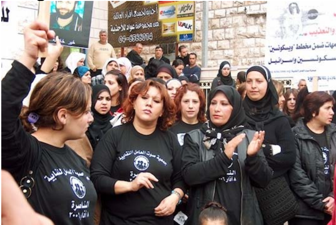
Members of the Women’s Platform demonstrate in Nazareth

“If We Go To The Labour Courts It Can Take Months Or Years. If We Are Organized, We Can Strike And Win”