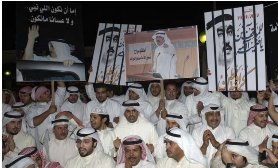
Supporters of detained opposition figure Musallam al-Barrak held banners and shouted supportive messages in Kuwait City October 30, 2012. Barrak was released on bail shortly thereafter.

“Day After Day, The True Ugly Nature Of The Security Apparatus Is Showing, Not Only Before The Kuwaiti People, But Before The Whole World”