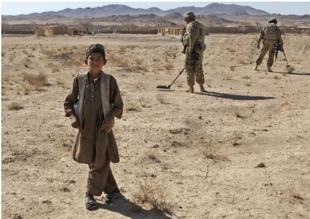
Missouri National Guard's 1138th Engineering Company in Afghanistan, January, 2013 sweep the area for IED's. The unit was stopped at the side of the road, waiting to see if another unit needed assistance.