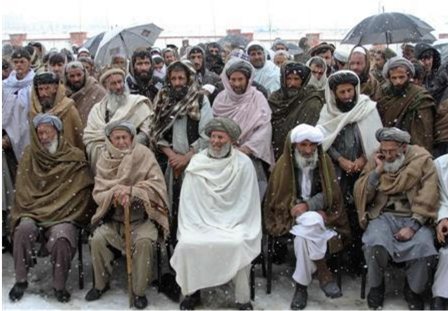
Afghan villagers attend a protest against U.S. special forces accused of overseeing torture and killings in Wardak province February 26, 2013.

In another incident that could feed local hostility to the American forces in Wardak, a Swedish organization which runs health clinics across Afghanistan accused the U.S. military on Tuesday of occupying and damaging one of its facilities.