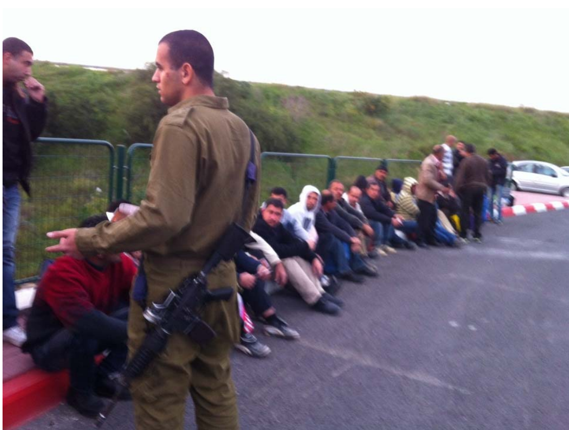
“They are then marched to the terminal fence and made to stand along it in a line, then to sit on the cold ground and wait.”