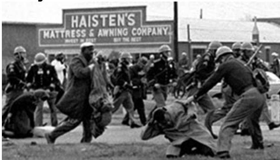
Alabama police attack Selma-to-Montgomery marchers

Carl Bunin Peace History; Americaslibrary.gov [Excerpts]