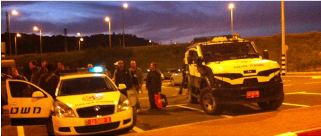
Soldiers and police remove workers from bus at Oranit Terminal