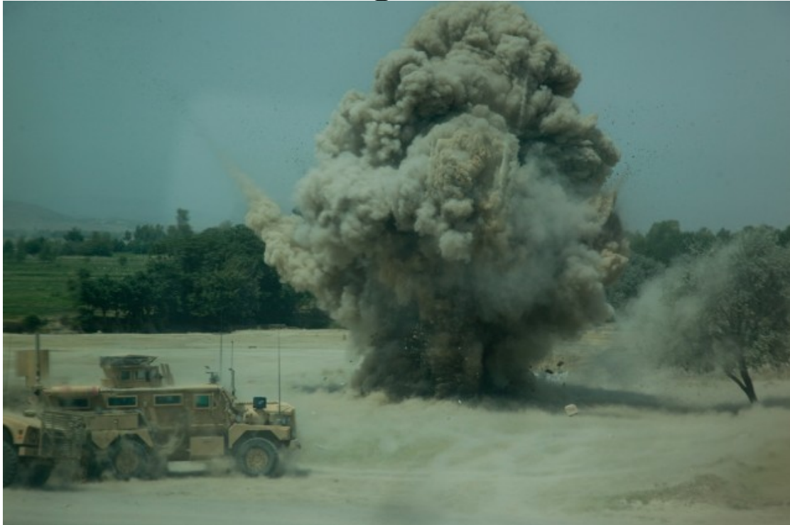
One of the dozens of extremely realistic IED explosions that occur aboard Joint Base Afghanistan every day during Enduring Freedom.

"Washington is clearly trying to send a message to Beijing, and that message is: if you so much as twitch at Japan, we will invade your country, topple your government, recreate it using most of the same people, then mull around for a decade while passing out kickbacks until we run out of money and forget why we're even there."