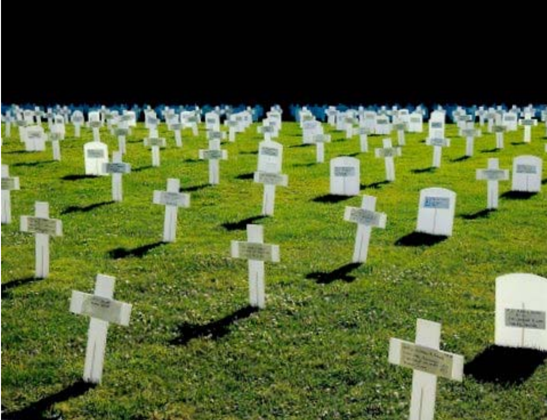
Arlington West on display in Seattle, Washington 2006. The crosses of Americans killed in Iraq and Afghanistan.