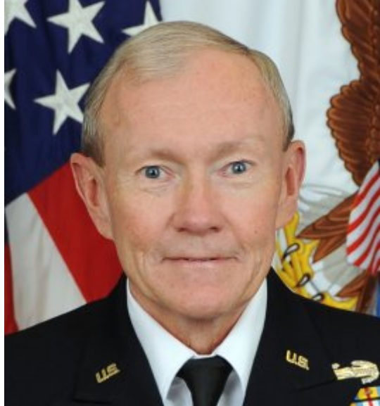
Gen. Martin Dempsey