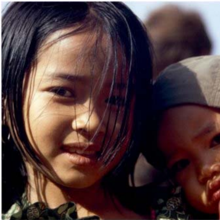
An Khe, Vietnam 1970.