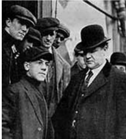
Arrested for “obstructing World War I: “Big Bill” Haywood