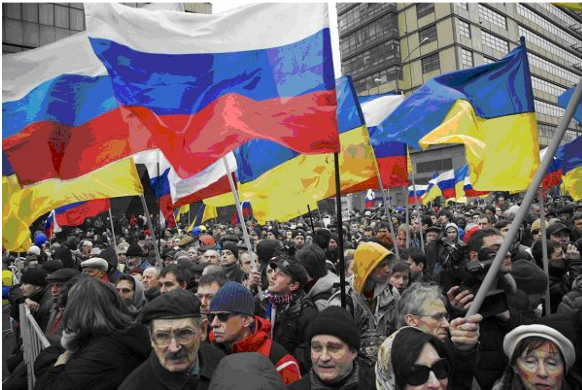
Demonstrators hold Russian and Ukrainian flags during a massive rally to oppose president Vladimir Putin's policies in Ukraine, in Moscow, March 15, 2014. .