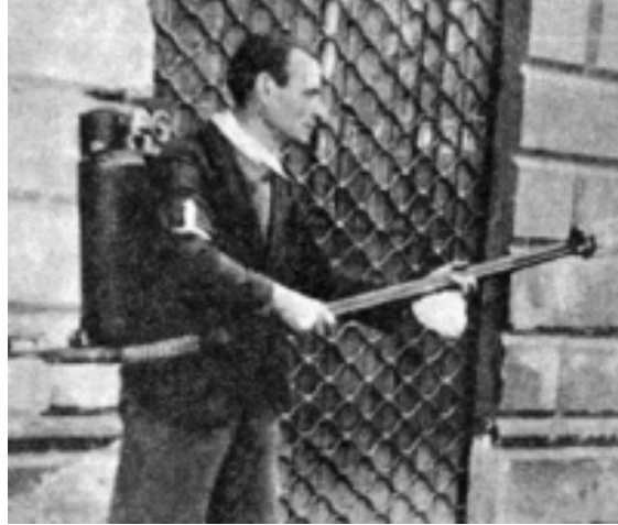
A resistance fighter with a homemade flame thrower during the Warsaw Ghetto Uprising.