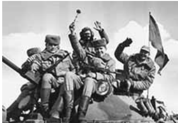
Happy Russian soldiers going home.