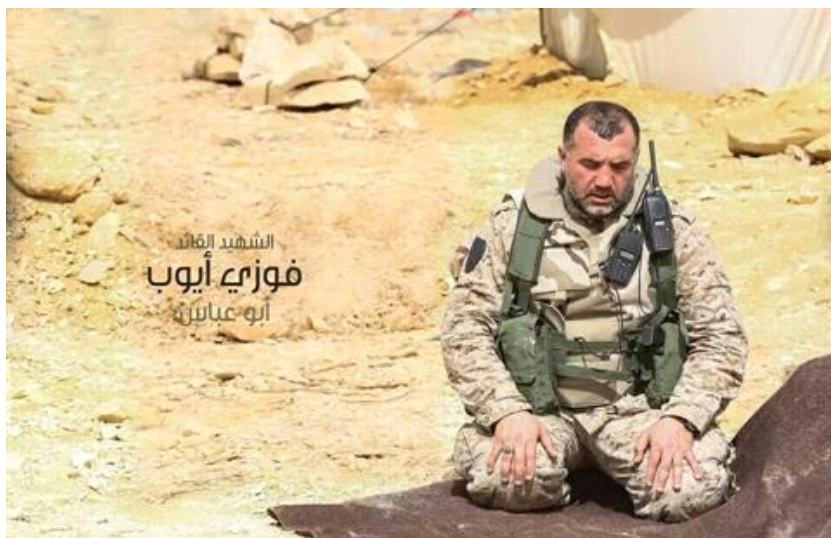
This undated file photo shows Hezbollah commander Fawzi Ayoub praying.