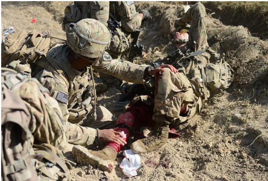
A U.S. Army soldier receives medical assistance after being injured by an explosive in Afghanistan in 2012.

“The Leadership Is Not Engaged To Solve The Problem Of Potentially Preventable Combat Deaths”