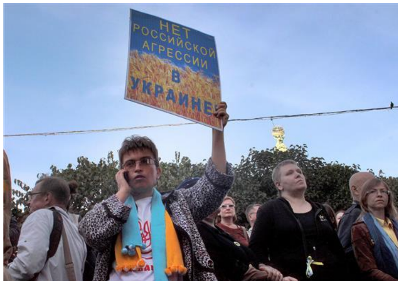
An anti-war protester holds up a sign that reads “No to Russian Aggression in Ukraine!” during Sunday’s event.

“Due To The Overwhelming Majority Of Anti-War Protesters, Violent Acts Were Few”