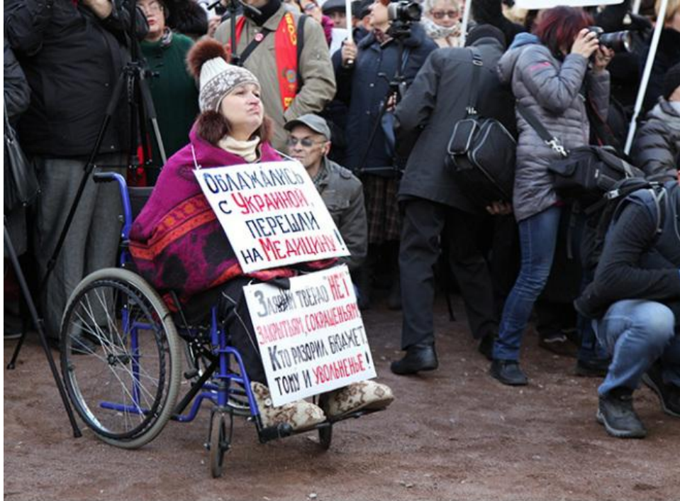
Protester at Sunday’s rally: “They screwed up with Ukraine, now they’ve moved to medicine. Let’s say a firm no to closures and layoffs. The people who busted the budget should be fired.”