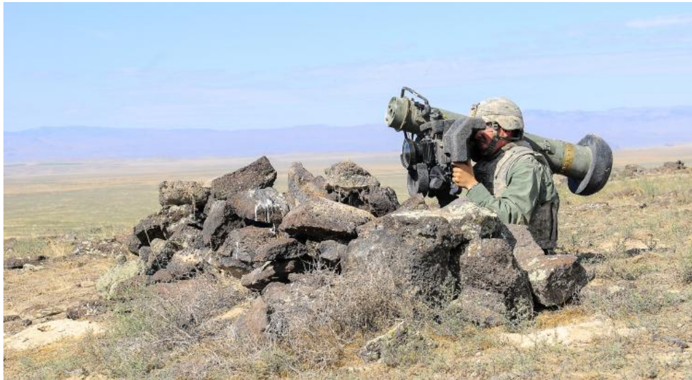
Raytheon's Javelin missile system will help jihadists to their eternal reward