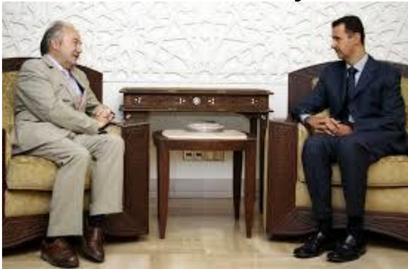
Galloway and Assad, two egomaniac supporters of genocide. Turds of a feather flock together.

“The Assad Regime Itself, Which These Upstanding ‘Anti-War’ Activists Continue To Venerate, Has Warmly Welcomed The US And Its Allies’ Participation In The Genocide Party”