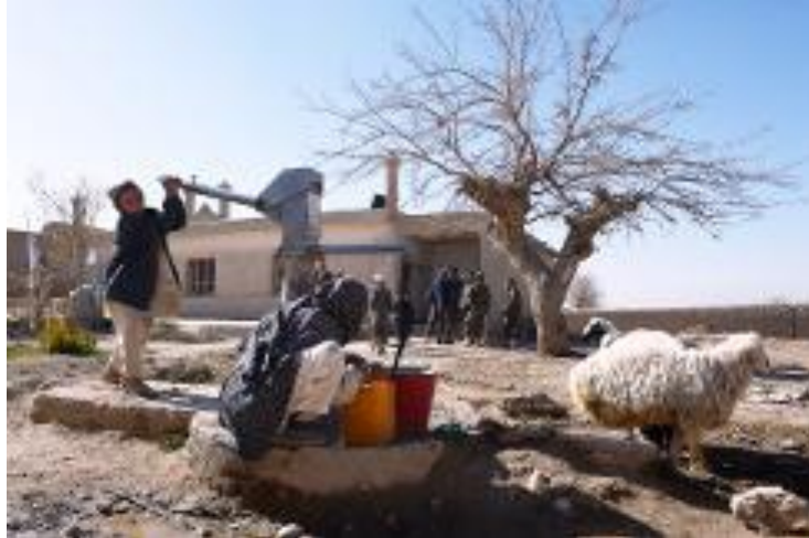
A boy helps a woman pump water into buckets in front of the mosque where Mullah Omar founded the Taliban movement 20 years ago in the village of Sangesar, southern Afghanistan on December 11, 2014.