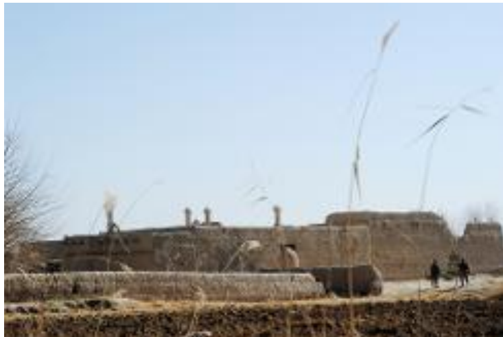
Afghan National Army soldiers keep watch near the remains of the house belonging to Mullah Omar close to the mosque where he founded the Taliban movement 20 years ago in the village of Sangesar, southern Afghanistan on December 11, 2014.