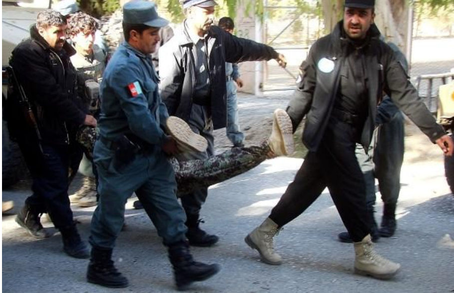
Afghanistan's security forces carry a dead soldier during clashes between Afghanistan's forces and insurgents over a branch of Kabul Bank on Wednesday.