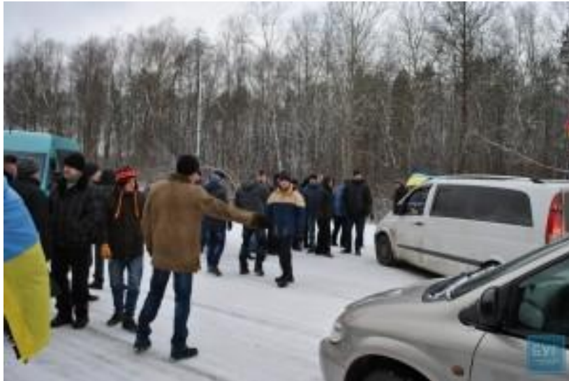
Striking miners at Novovolyns'kyi coal mine in Volyn region block a road on Dec 27, 2014