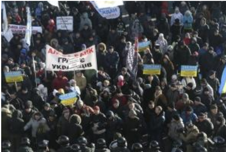
Ukrainians protest against state budget 2015 proposals in Kyiv, Ukraine, Dec. 28, 2014

Dec. 28, 2014 THE UKRAINE TODAY DAILY NEWSLETTER