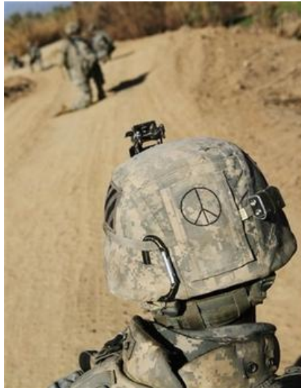
U.S. soldier in Beijia village Iraq, Feb. 4, 2008.

Forward Military Resistance along, or send us the email address if you wish and we'll send it regularly with your best wishes. Whether in Afghanistan or at a base in the USA, this is extra important for your service friend, too often cut off from access to encouraging news of growing resistance to injustices, inside the armed services and at home. Send email requests to address up top or write to: Military Resistance, Box 126, 2576 Broadway, New York, N.Y. 10025-5657.