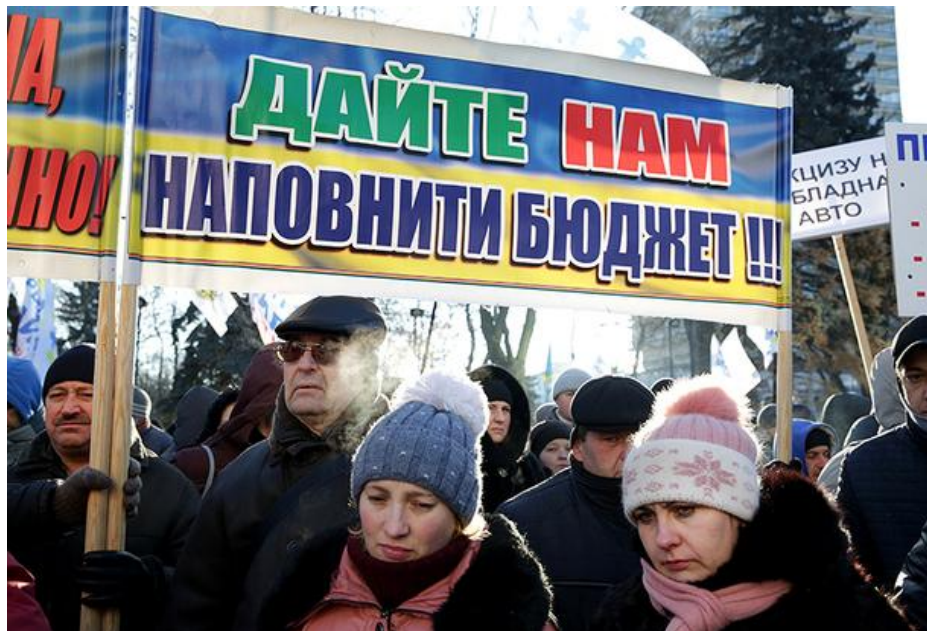
People protest against the proposed budget outside the Ukrainian parliament building on Dec. 28. The poster reads "Let us fill in the budget". Kyiv Post. Photo: Anastasia Vlasova

Other protests occurred in the days following, including by hundreds of people on Dec. 28.