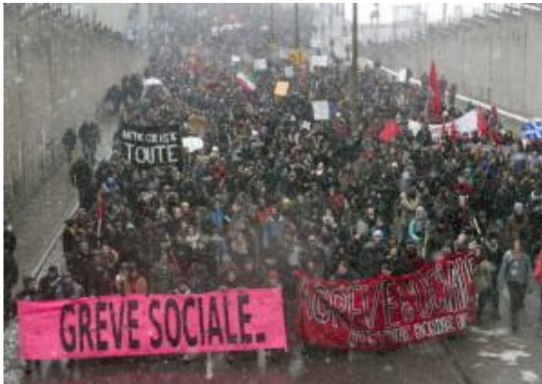
Anti-austerity march in Montreal, March 21, 2015