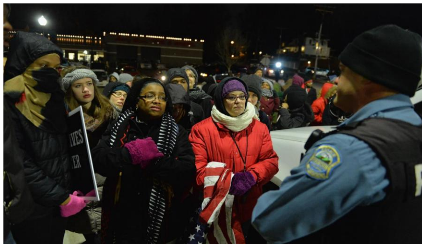
Ferguson police and demonstrators after justice department report released.