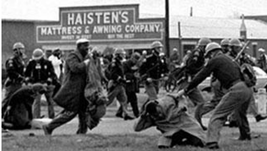
Alabama police attack Selma-to-Montgomery marchers

Carl Bunin Peace History; Americaslibrary.gov [Excerpts]