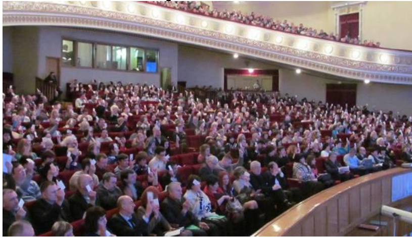
Inaugural Congress of the Federation of Trade Unions of the Donetsk People’s Republic, 21 February 2015

“We Can Stop Thinking About The Development Of An Independent Trade Union Movement In These ‘People’s Republics’”