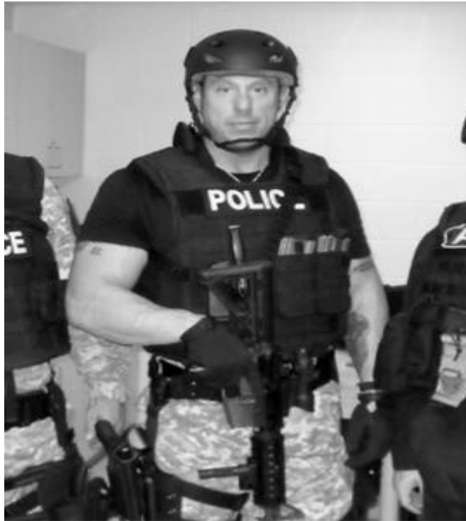
Twisted Freak Menendez: Daily Kos