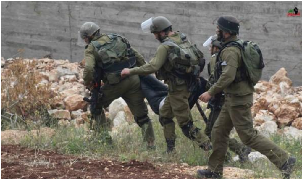
Israeli forces arresting an unconscious man

17th April 2015 International Solidarity Movement, Huwwara Team