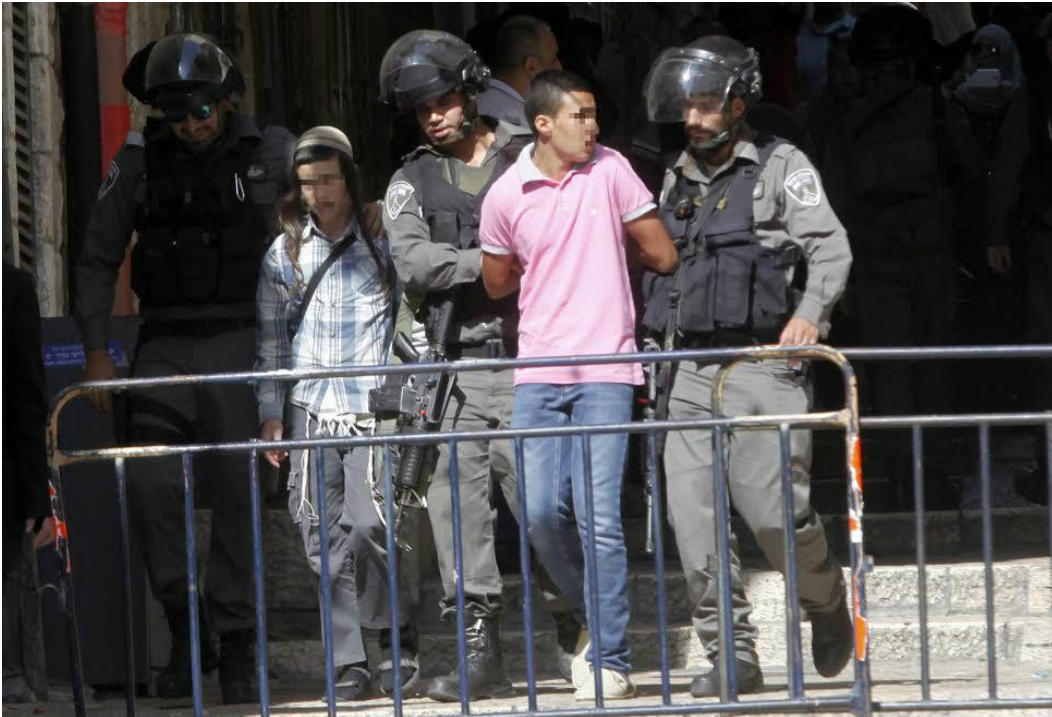
A. (right) is arrested by Border Police, while the Jewish boy who accused A. of assaulting him, Jerusalem's Old City, July 25, 2015.

The difference in body language between the two boys — and between them and the policemen — is well pronounced, giving the photo its power. They illustrate better than any description what occupation and apartheid look like: a regime based on total separation between two groups that are treated in a very different manner by the government.