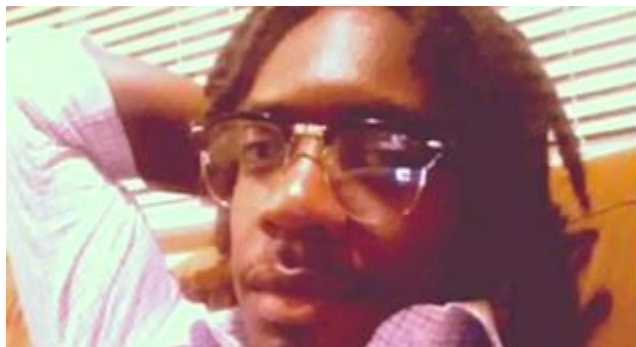
“Shakespeare” Executed By Order Of Racist Hotel Owner