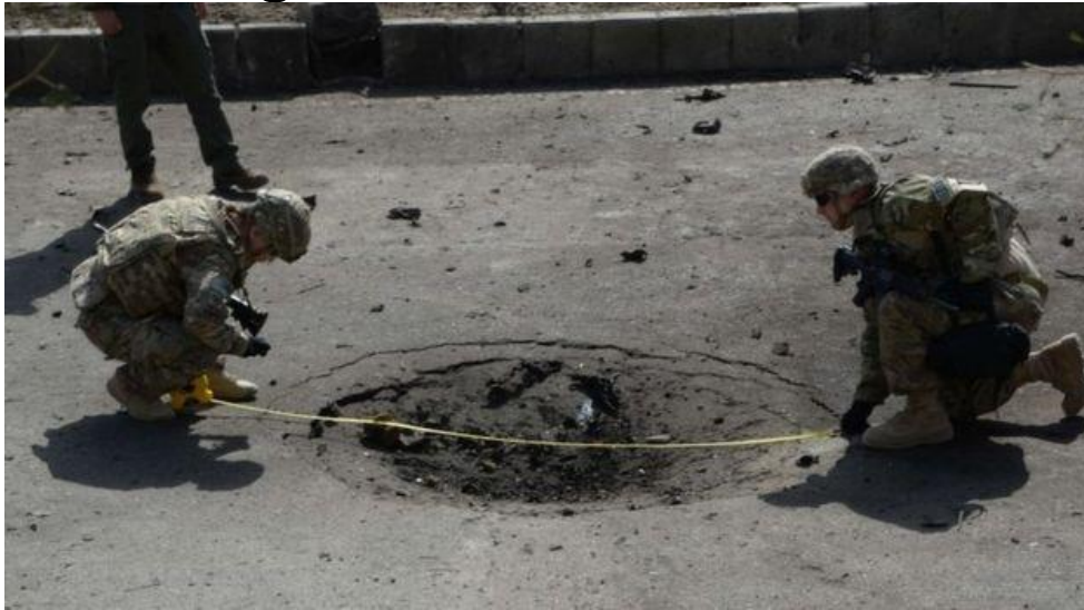
Troops examining the bomb scene. BBC

11 October 2015 BBC & RAHIM FAIEZ, Associated Press