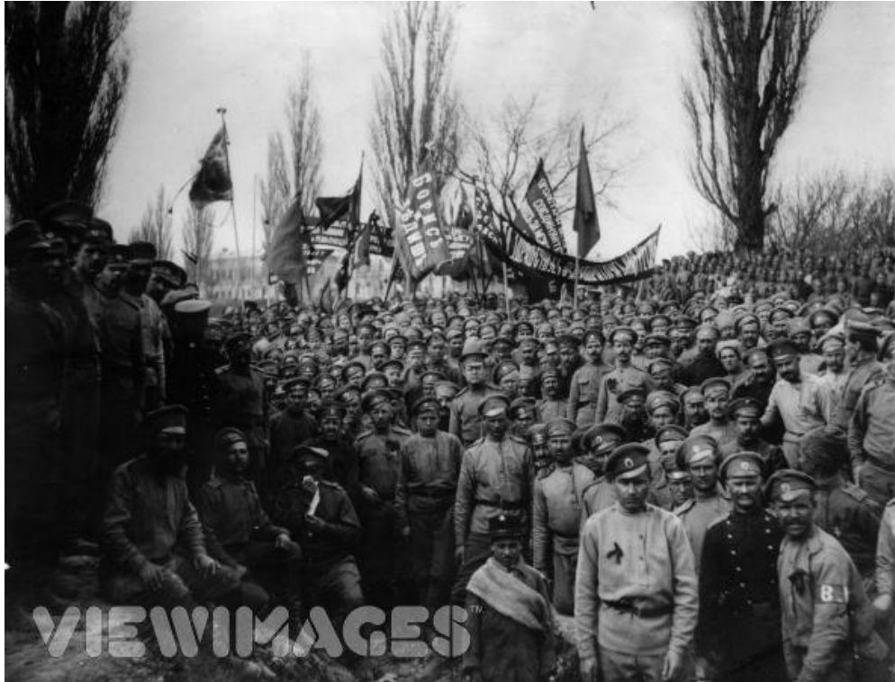
Revolutionary Army: (Photo by Hulton Archive/Getty Images)

September 28, 2007 By PAUL D'AMATO, Socialist Worker [Excerpts]