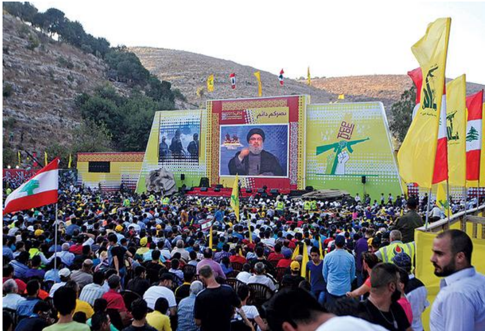
Hezbollah supporters listened to Sheikh Hassan Nasrallah speak from a secret location on a TV screen in Wadi al-Hujair, Lebanon, Aug. 14.

“It’s Not Only Me. There Are People Who Want To Quit Who Have Had Enough Of It”