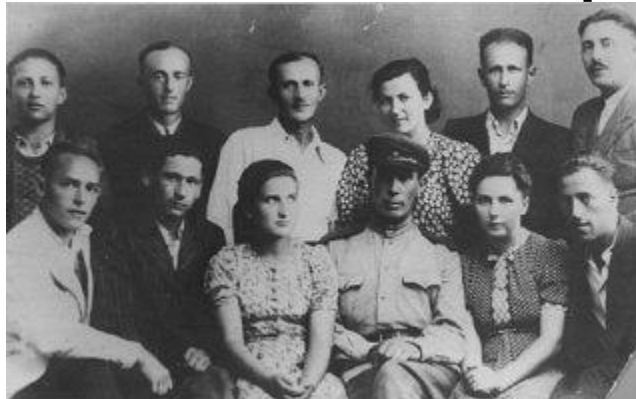
A group portrait of some of the participants in the uprising at the Sobibor extermination camp. Poland, August 1944.