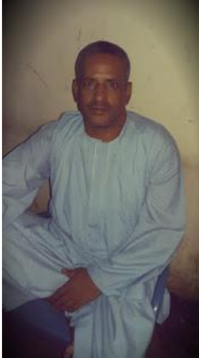
Late Talaat Shabeeb