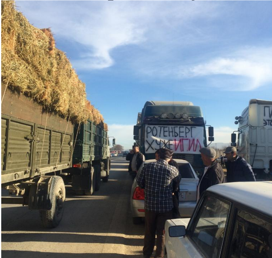
“Rotenberg is worse than ISIS.”

Every trucker now knows that billionaire Arkady Rotenberg is a friend and supporter of President Putin, that Arkady Rotenberg has a son named Igor Rotenberg, and that Igor Rotenberg owns a little company that mysteriously signed a contract with the government farming the new federal transportation tax out to this private company.