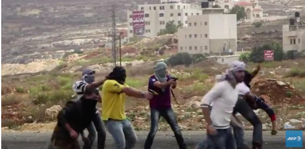
Still from AFP video shows Israeli agents who moments before were posing as demonstrators pull guns on Palestinians.

7 October 2015 by Ali Abunimah, electronicIntifada.net [Excerpts]