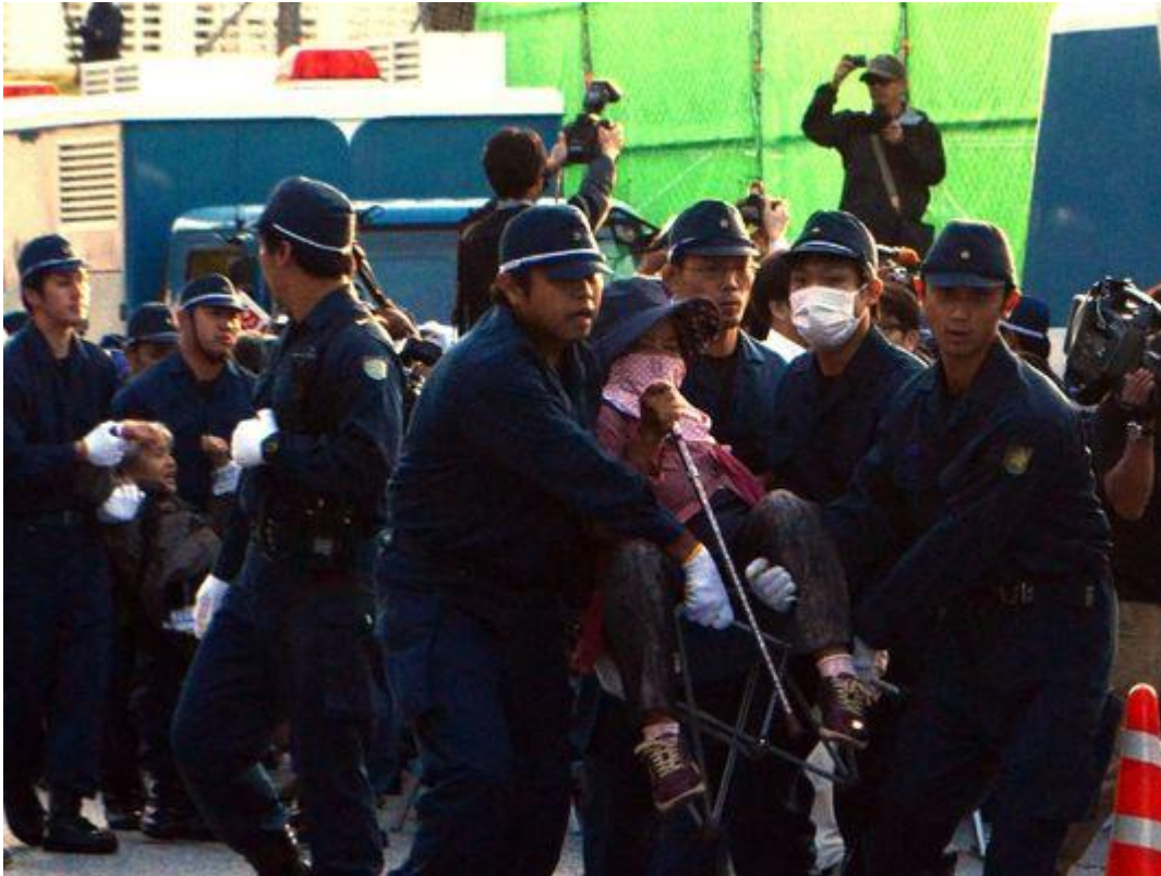
Police officers remove protesters from a gate of the US Marine base as they staged a sit-in protest at Nago on Japan's southern island of Okinawa on ...