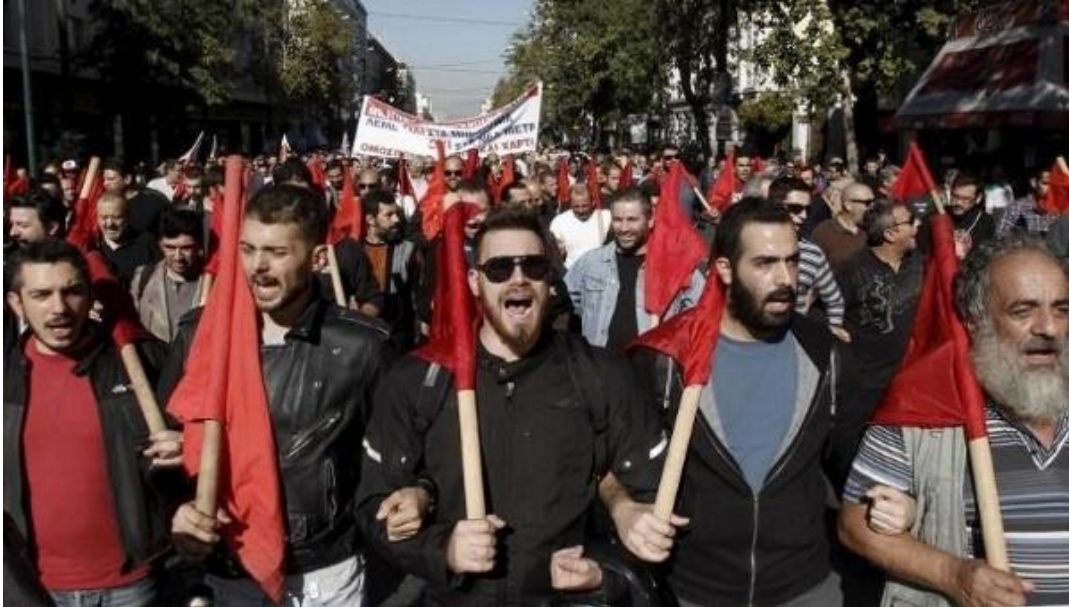
Green Left Weekly