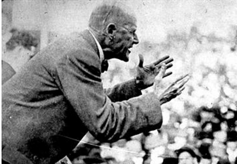
Canton, Ohio June 16, 1918