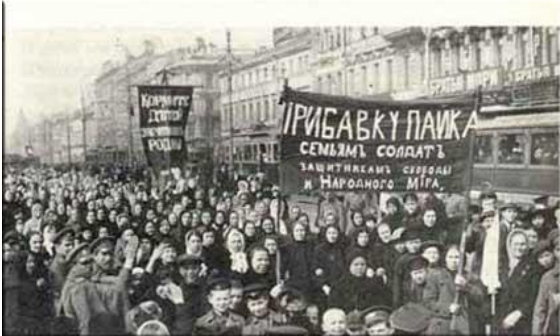
Soldiers' wives demand increased rations in a demonstration along the Nevskii Prospekt following the celebration of International Women's Day, February 23, 1917.

Around the barracks, sentinels, patrols and lines of soldiers stood groups of working men and women exchanging friendly words with the army men. This was a new stage, due to the growth of the strike and the personal meeting of the worker with the army. Such a stage is inevitable in every revolution.