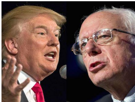
Black Agenda Report

“The Forces Of US Capital Neither Want An Unpredictable Commander In Chief Nor One That Will Inspire Masses Of People To Push For Concrete Demands”