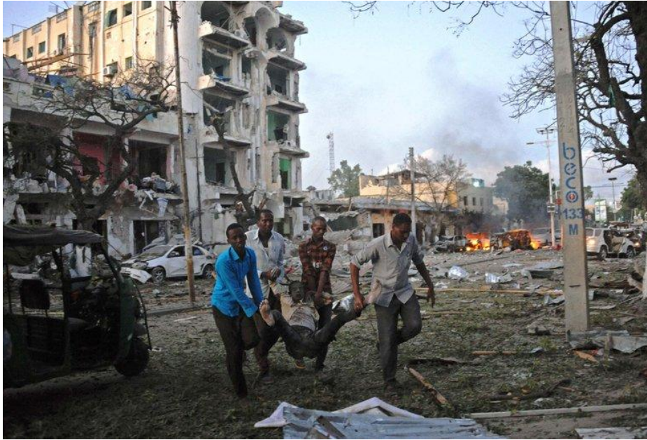
The Ambassador Hotel in Mogadishu, Somalia, on Wednesday.