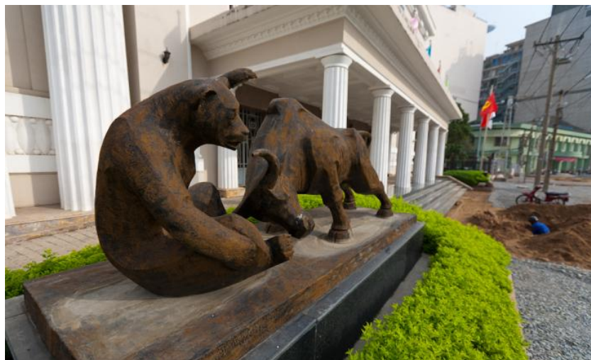
“The Ho Chi Minh City Stock Exchange, with a Vietnamese version of Wall Street wildlife,” by Kris à Genève.