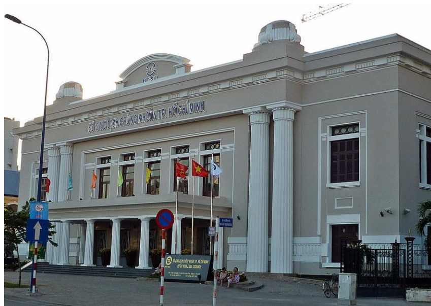
Ho Chi Minh City Stock Exchange is the largest stock exchange in Vietnam, located at the T-junction Vo Van Kiet and Nam Ky Khoi Nghia Street. Ho Chi Minh City was formerly known as Saigon.