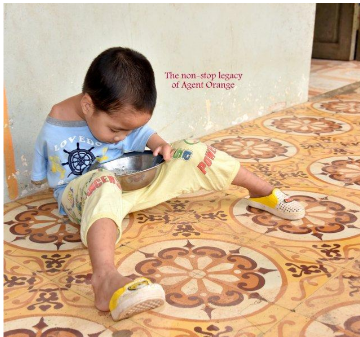
Orphanage in Hanoi, Vietnam April 2016.