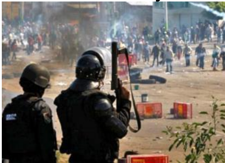
Federal police unleashed a deadly assault on protesters in Oaxaca

The Repression On Sunday Was Followed By A Courageous March Of Tens Of Thousands To The Zócalo In Oaxaca City