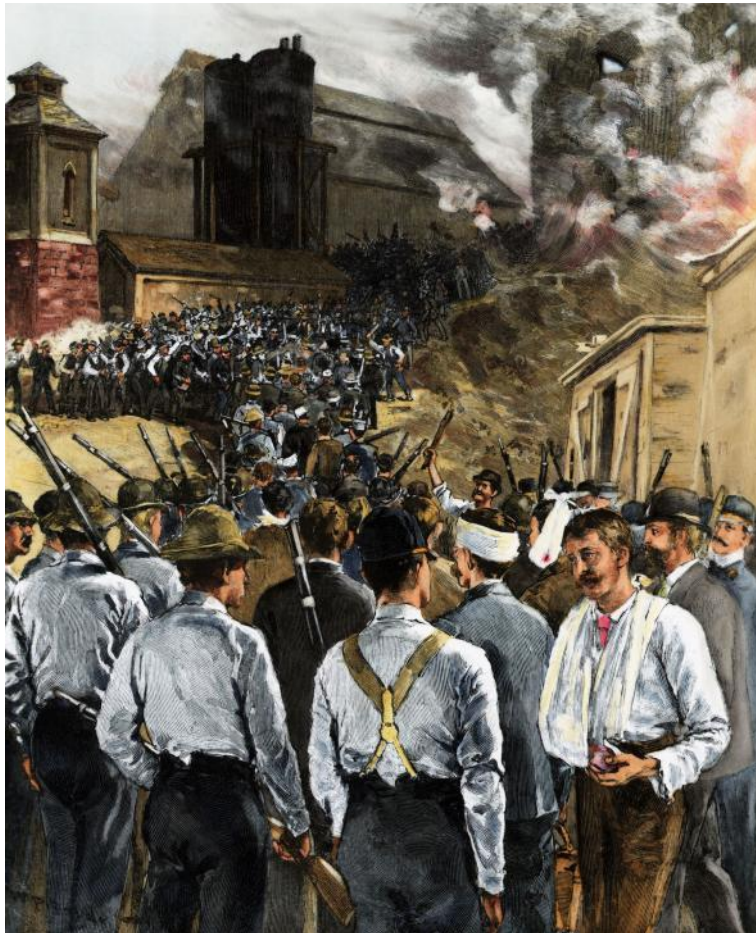
Defeated Pinkerton agents, escorted by armed union men, leaving their barges after surrendering.