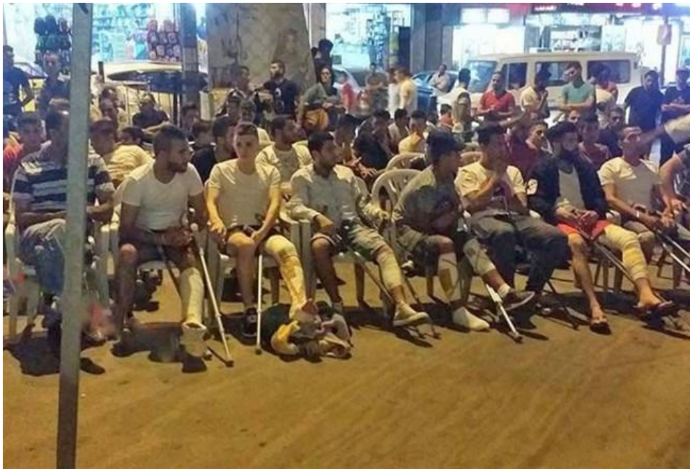
A file photo of a group of Palestinian youth after being treated for gunshot injuries by Israeli forces