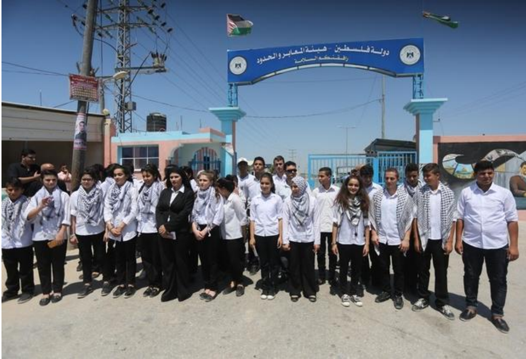
Al-Sununu Institution, which was established in 2010, focuses on songs from Palestinian and Arab heritage