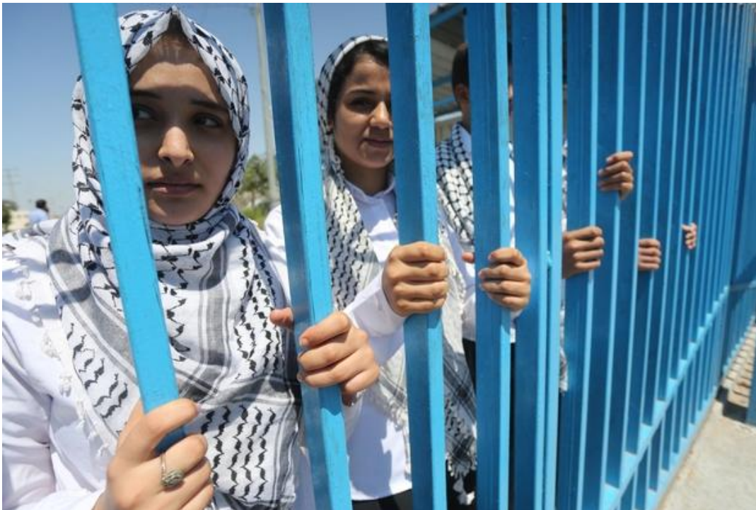
Female members of the Palestine Sings children chorus look beyond the gate at Erez crossing