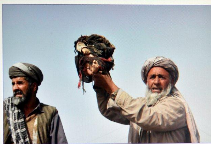
An Afghan man holds up the body of a child that was killed during clashes between Taliban and Afghan security forces in Kunduz province north of Kabul, Afghanistan, Thursday, Nov. 3, 2016. Authorities say a joint raid by U.S. and Afghan forces targeting senior Taliban commanders killed two American service members and 26 civilians. Afghan officials said they were still investigating the attack and its civilian casualties, some of which may have been caused by the airstrikes.