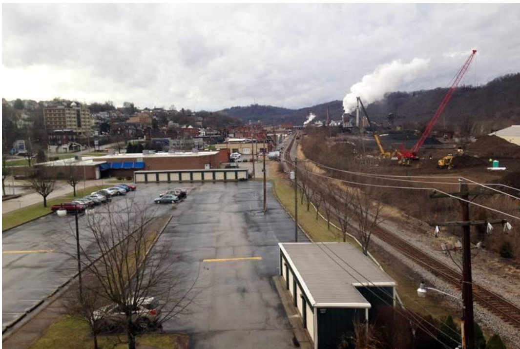
Voters in failing Monessen, Pa., hope Donald Trump will deliver on his economic promises.