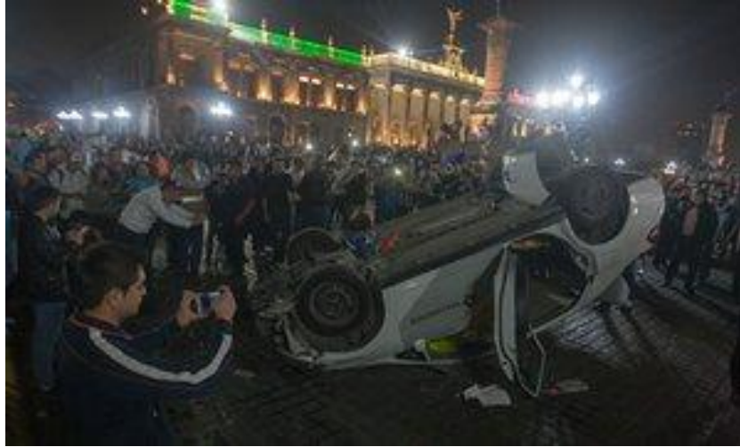
A car is overturned outside the Palacio de Gobierno in Monterrey Nuevo Leon on Thursday night after Mexico’s government imposed a 20% rise in the price of gasoline.