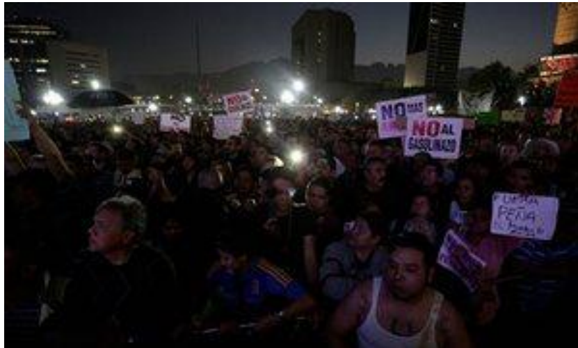
Demonstrators hold up placards during a protest at the Macroplaza in Monterrey on Thursday.