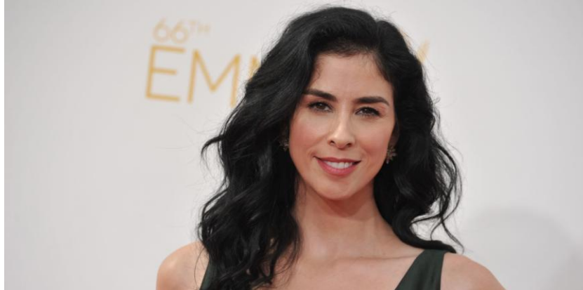
The Huffington Post

Feb 03, 2017 By Leslie Salzillo, Daily Kos [Excerpt]