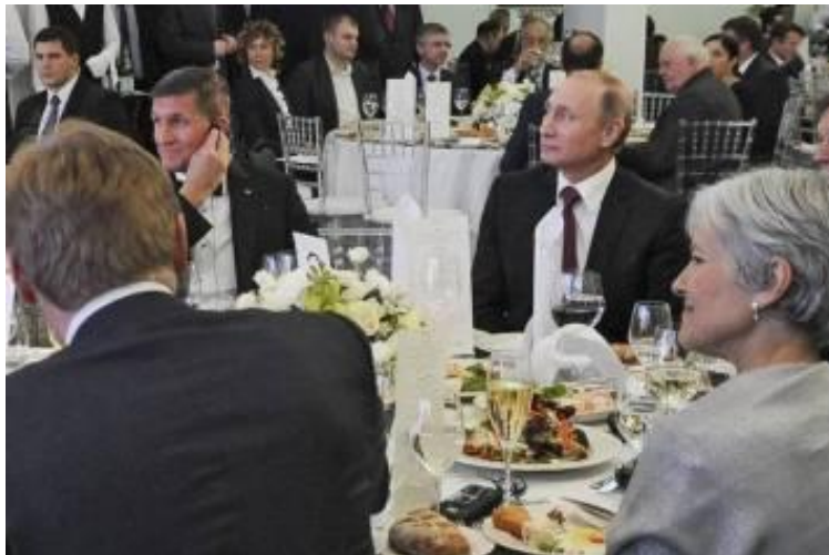
Mike Flynn (with hand to ear) appearing at the RT gala in Moscow with Putin. (At lower right is Green Party's Jill Stein)

Initially, he denied he'd discussed the US sanctions, but then it was proven that he had. Meanwhile, Vice President Pence went on TV to also deny that Flynn had discussed that issue. Did Flynn lie to Pence about that (as they both claim), or is he taking one for the team? We'll probably never know.