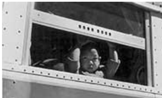
Japanese-American child on bus to concentration camp.

Carl Bunin Peace & Justice history February 13-19