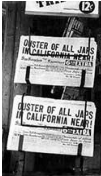
San Francisco Chronicle February 27, 1942.