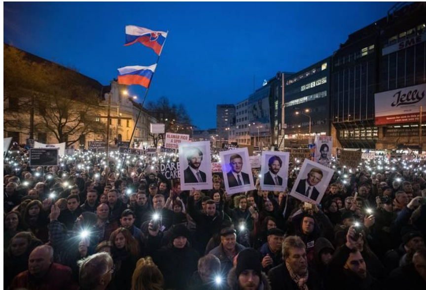
People participate in a rally in Slovakia' in Bratislava on March 9 following the killing of a journalist in late February.

March 14, 2018 By Drew Hinshaw, Wall Stgreet Journal