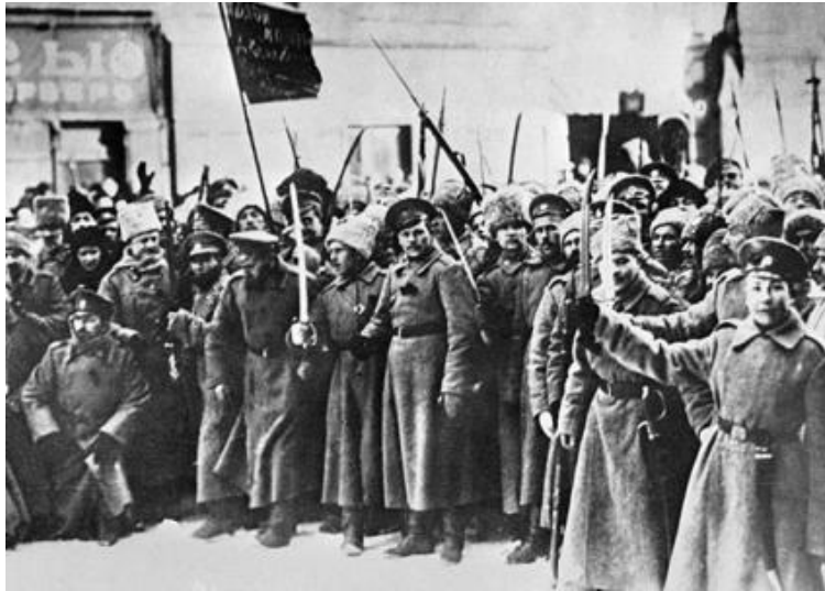
Russian soldiers celebrate the end of Tsarist rule following the February Revolution

“Those Coming To Join You Include Not Only Friends But Also Officers, Who Are Former Enemies And Who Only Pretend To Be Your Friends”