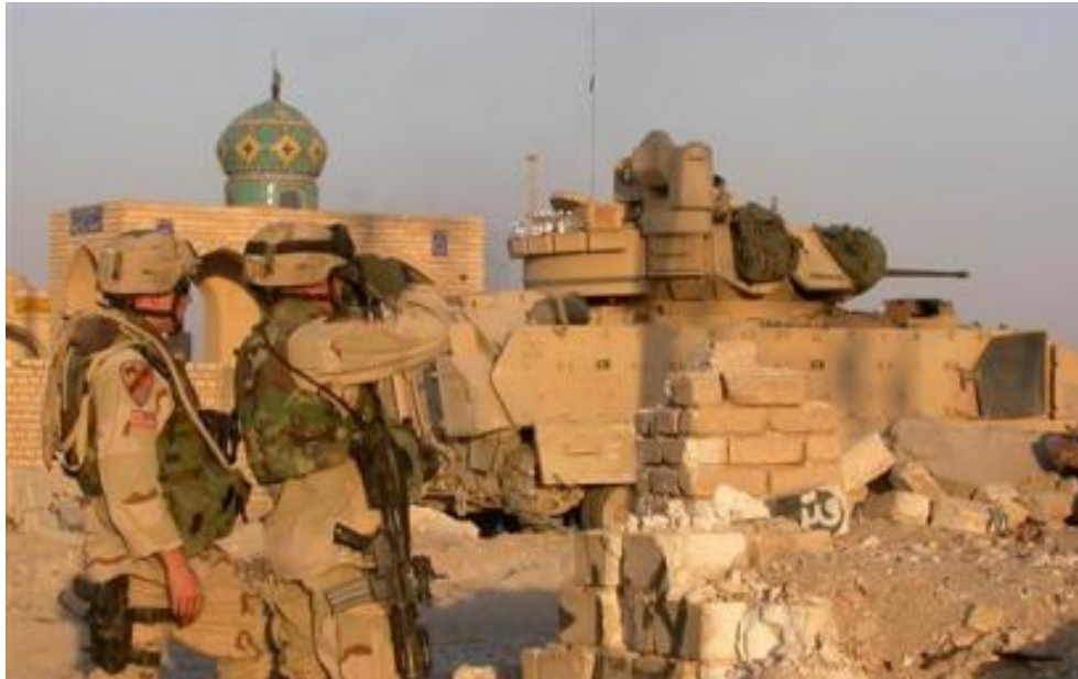
American soldiers look towards Mahdi army positions at the world's largest cemetery in the holy Shiite city of Najaf Aug. 12.