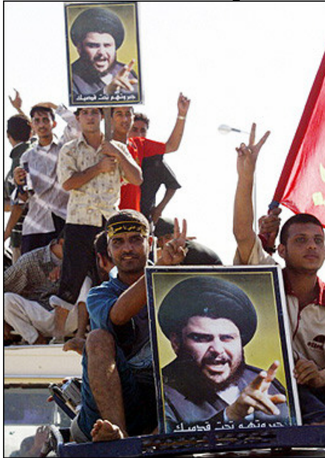
Supporters of Shiite Muslim cleric Moqtada Sadr (pictures) arrive in Najaf from Baghdad.

OCCUPATION ISN'T LIBERATION BRING ALL THE TROOPS HOME NOW!