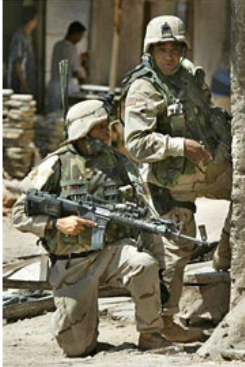
NAJAF (Islam Online)